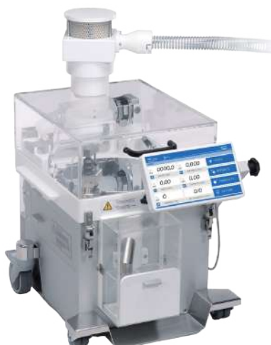
UTS-S20 IPC version Dust-proof Tablet Testing System with Single Tablet Feeder (OEB level 3) Direct connection with all tablet presses is possible