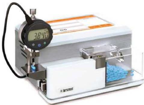
HC7 Manual Tablet Hardness Tester