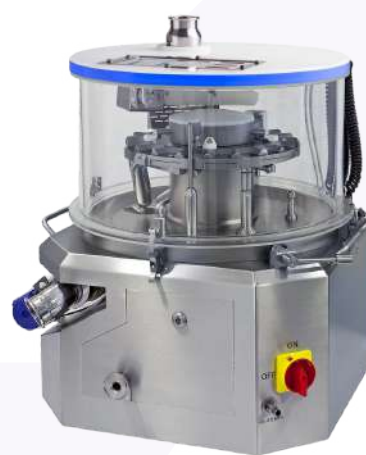
UTS-IP65i Containment & Wash-in-Place Tablet Testing System (OEB level 5)