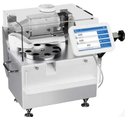
Automatic Weighing System for Tablets & Capsules CIW (available in Lab & IPC versions)