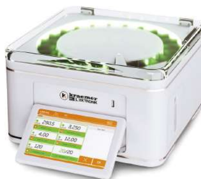
P-Series Semi-Automatic Tablet Testers P3, P4, P5