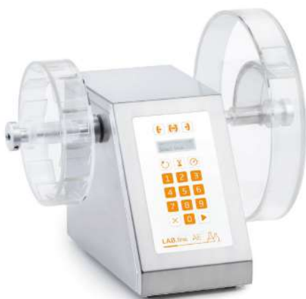
Friability + Abrasion Testers AE-1i with one drum axis AE-2i with two drum axes