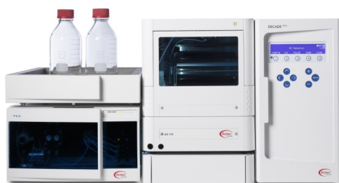
Fig. 1. ALEXYS LC-EC analyzer, UHPLC (1 channel).

Plant sterols and plant stanols, known commonly as phytosterols, are plant-derived compounds that are structurally related to cholesterol [1]. It is well established that high intakes of plant sterols or stanols can lower serum total and low-density lipoprotein (LDL)-cholesterol concentrations in humans [2]. Important food sources of phytosterols include unrefined vegetable oils, whole grains, nuts, seeds, and legumes. Furthermore, phytosterols enriched foods and beverages are available in many countries nowadays. However, there are no clinical data available indicating that such foods reduce cardiovascular events [3]. Sterols can be electrochemically detected without derivatisation, on boron-doped diamond (BDD) electrodes at high potentials (see figure 3). This note shows the proof of principle for the fast and sensitive analysis of Phytosterols using the ALEXYS LC-EC analyzer.