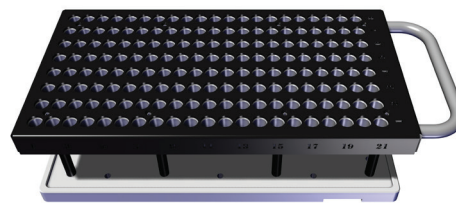
Collection Rack for 12 x 32 mm HPLC Vials