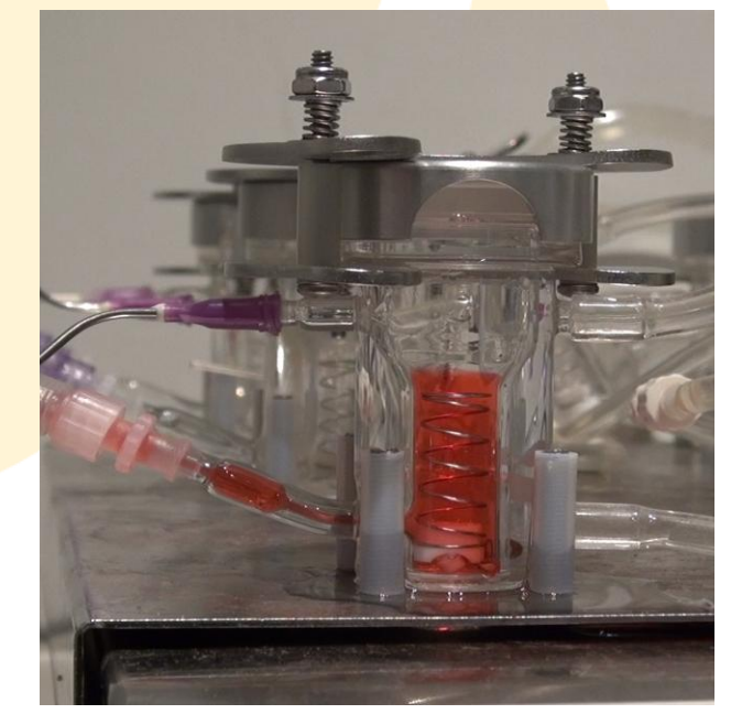
Figure 1: 7 mL diffusion cell with 2.0 mL of replacement media (red).