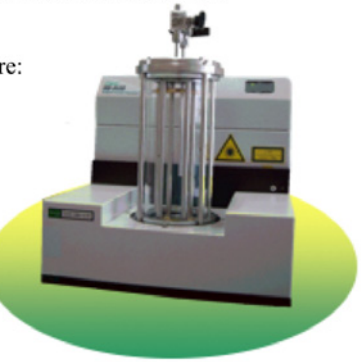
Figure 1: VIR-9500 & 8 m gas cell