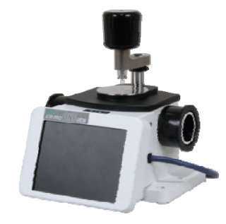
Fig.1 ATR PRO ONE VIEW

FT/IR-4600 Instruments: Detector: DLATGS 4 cm<sup>-1</sup> Resolution: Accumulation: 50 times Method: ATR Accessory: ATR PRO ONE VIEW Prism: PKS-D1V