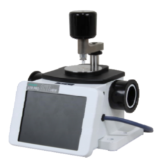
Fig.1 ATR PRO ONE VIEW

Instruments:FT/IR-4600Detector:DLATGSResolution:4 cm<sup>-1</sup>Accumulation:50 timesMethod:ATRAccessory:ATR PRO ONE VIEWPrism:PKS-D1V