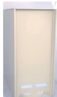
Storage Tank for up to 60 l