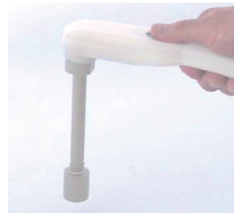
Remote Control Outlet