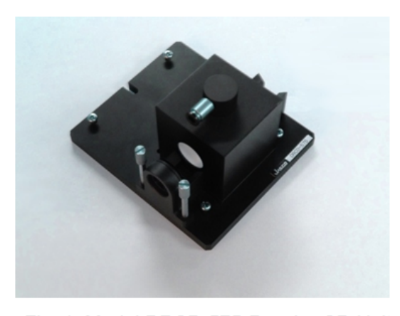
Fig. 1 Model DRCD-575 Powder CD Unit