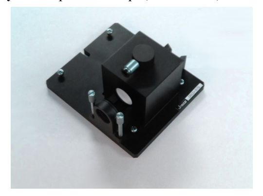
Fig. 1 Model DRCD-575 Powder CD Unit