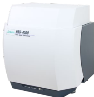
Fig. 1 NRS-4500 Laser Raman Spectrometer

In order to suppress denaturation of samples, a high-speed imaging function QRI (Quick Raman Imaging) was used, and laser irradiation time was minimized.