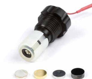
Working electrode holder with different working electrodes (left to right): Pt, Au, MD, GC