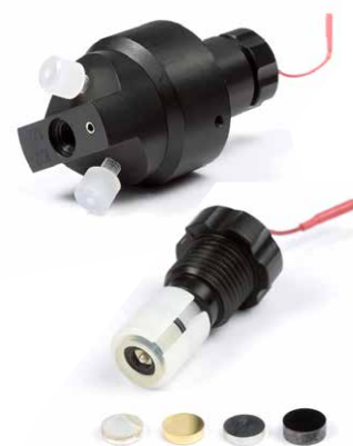
Top: Assembled FlexCell Bottom: Working electrode holder with working electrodes (from left to right): Pt, Au, MD, GC

The name FlexCell™ underlines the versatility and service-ability of this thin-layer flow cell in the Antec program. With its unrivaled design working electrodes can be serviced or replaced in a few minutes. The low cost of ownership is also attributed to the concept that different working electrode materials can be applied in the same cell. This makes the Flex-cell suitable for all sorts of electrochemical analyses like the usual biogenic amines (glassy carbon), but also carbohydrates (gold), peroxides (platinum), halides (silver), sulfides (Magic Diamond) etc.