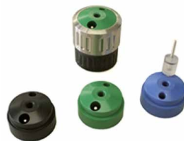
Color coded reference electrodes black: HyRef (Pd/H 2 ) green: ISAAC (in situ Ag/AgCl) blue: Salt bridge (Ag/AgCl)

The SenCell™ is a new generation electrochemical flow cell specifically designed for highest sensitivity. The tool free assembly and the continuously adjustable working volume guarantee ease of use and fast noise stabilization. The volume of the cell can be adjusted between 0 and 300 nL.