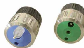
DECADE Elite available in blue or white colored housing. SenCell in front. Blue: salt bridge (Ag/AgCl), green: ISAAC (in situ Ag/AgCl) reference electrode.