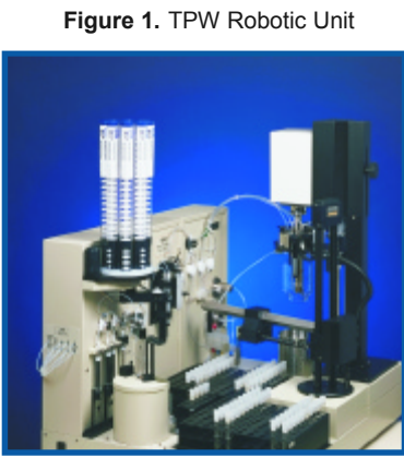
Figure 1. TPW Robotic Unit

Figure 1 shows the TPW Robotic Unit. The hardware includes test tube racks, robotic arm, filter dispenser, disperser station which contains a 3-place balance, and a dispense station which contains a 4-place balance.