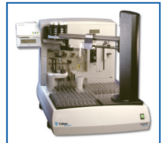
Figure 3. Prelude Robotic Unit

The Prelude was determined to be 100% compliant without modification. By having a test standard in place for 21 CFR Part 11 compliance, this product was designed to meet the regulation. The specific validation test plan and its execution were completed in less than one week.