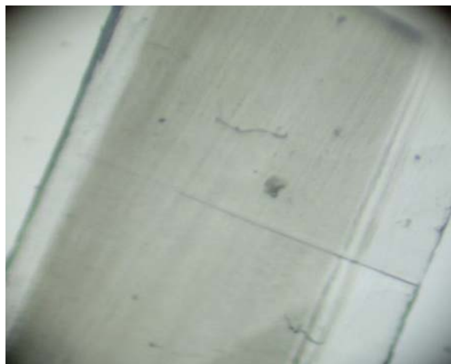
Figure 1. Juice bottle laminate under the FTIR Microscope, visually, you can identify at least 4 layers in this image.

Several different polymer materials were selected for analysis including a prepared juice bottle and a plastic food container. Laminate samples of controlled thickness were sectioned with a razor blade and the cross section examined using the FT-IR microscope. Microscope apertures ranging from 15 x 15 to as large as 50 x 50 microns were used to define sample areas for analysis.